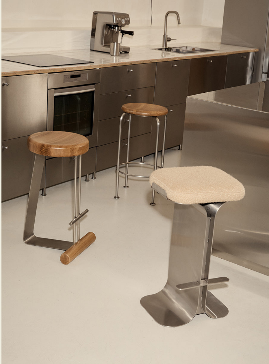
A plush upholstered seat set against a stainless steel base defined by curved steel plates.