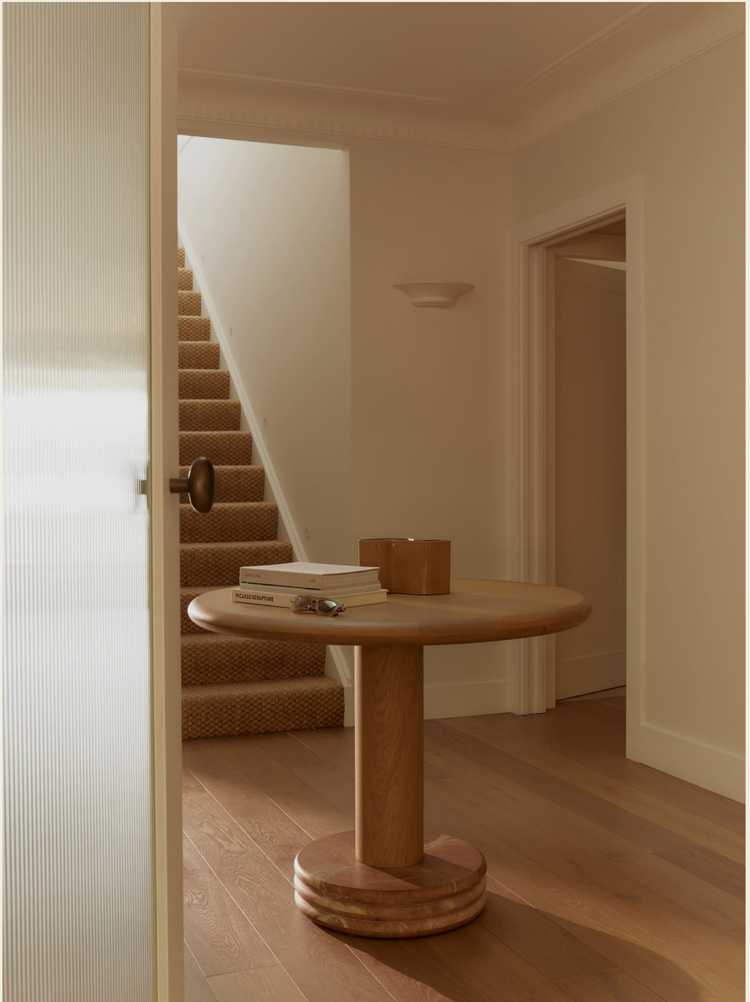
BISTRO DINING TABLE